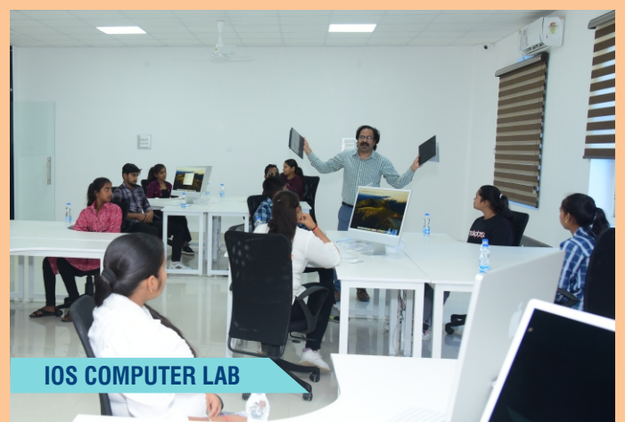
IOS COMPUTER LAB

Class rooms are well equipped with multimedia and audio-visual equipment. Class rooms are designed to promote maximum interaction between faculty and students. Each class room has internet connectivity through Wi-Fi.