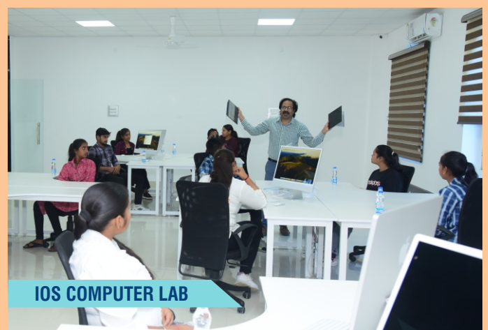
IOS COMPUTER LAB

Class rooms are well equipped with multimedia and audio-visual equipment. Class rooms are designed to promote maximum interaction between faculty and students. Each class room has internet connectivity through Wi-Fi.